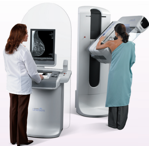
The Selenia Dimensions system is designed to maximize patient comfort during the exam.