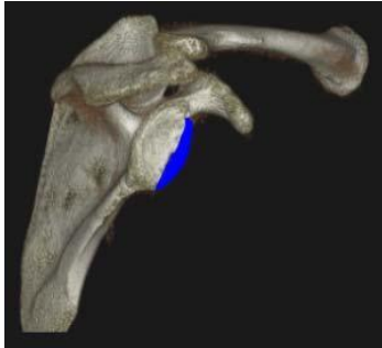
Figure 1: A 3D CT reconstruction of the scapula. The blue segment illustrates the bony deficit of the glenoid.

When bony lesions reach critical dimensions, reconstruction of this deficit using autograft bone yields the best surgical results. The Latarjet procedure is the most popular and highly effective, transferring the distal coracoid into the bony defect. 3